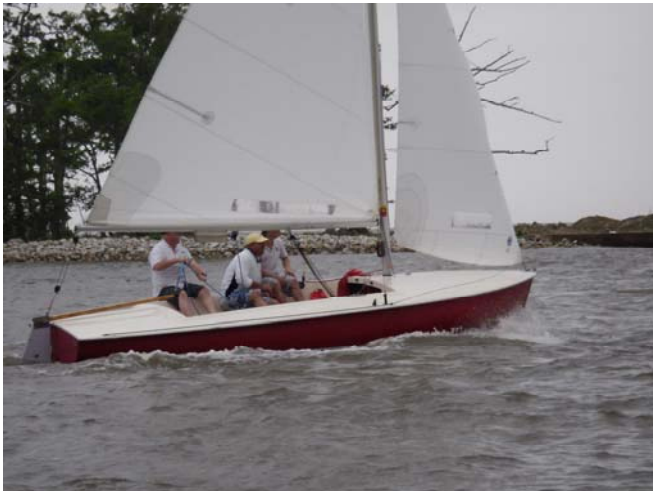
Opening Regatta—Capdeville Series